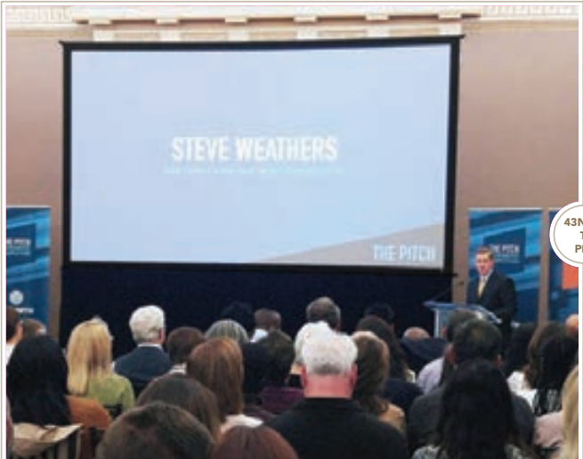
43NORTH THE PITCH