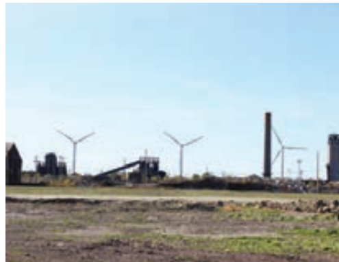
Current Net Zero site.