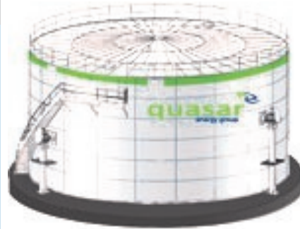
Biomass Equalization Tank